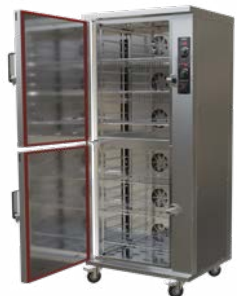
Landscape oven configuration. One compartment with twin doors