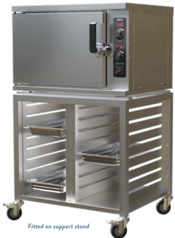
Fitted on support stand