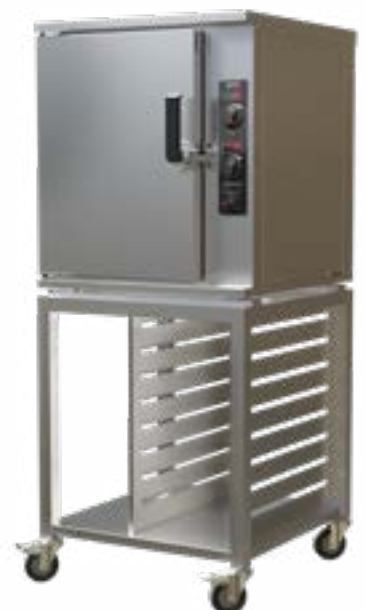
Fitted on support stand