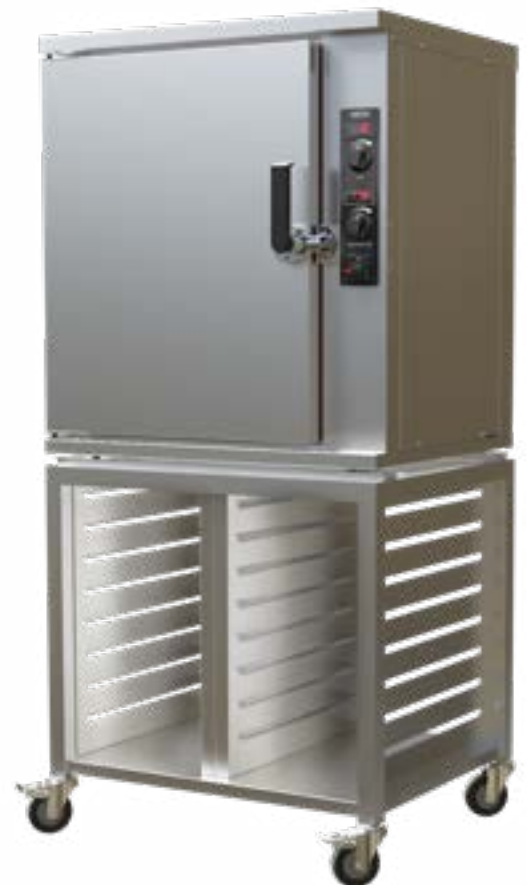
Fitted on support stand