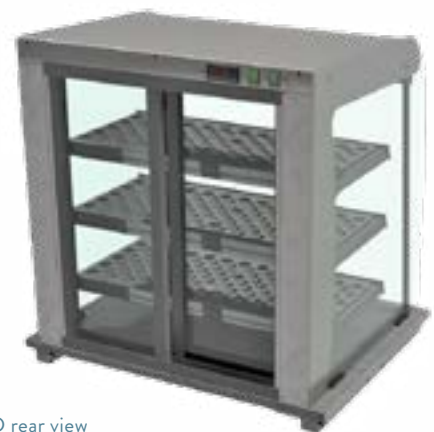
D2HD rear view