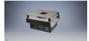
Sahara Fan Model SF309

Dimensions Width - 1158mm Depth - 680mm Height - 900mm Weight - 75kg