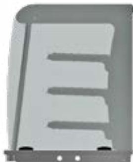
Curved glass option