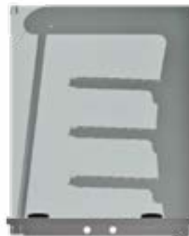
Square glass option